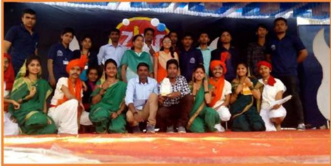
Team BBA 1st Rank Folk Dance Zing 2K18 (Mega Inter Collegiate Event) CSIBER College, Kolhapur