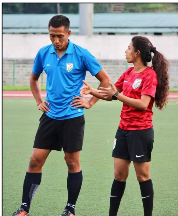
Grass Route Committee, Asian Football Confederation, and Head of Department Grass Route Coaching, All India Football Federation, New Delhi.