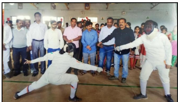
Organization of Shivaji University Interzonal Fencing Men and Women Tournament.