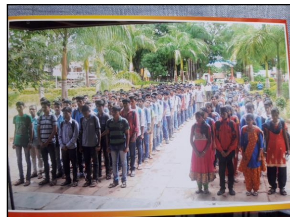
Oath for Voting